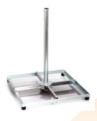
Plate size: 4 x 300 x 300 mm.

Coating: Electro Galvinised Pole diameter: Ø 42 x 2 mm. Pole Height: 750 mm