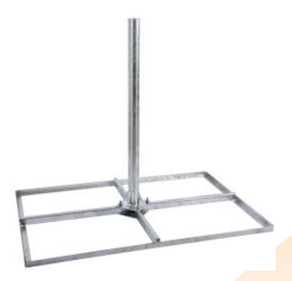
Plate size: 4 x 300 x 300 mm.