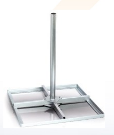
Plate size: 4 x 300 x 300 mm.